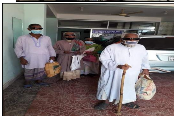
Picture of eye camp