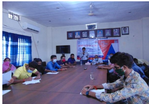
Civil surgeon receive the Memmorandum and Press Conference.