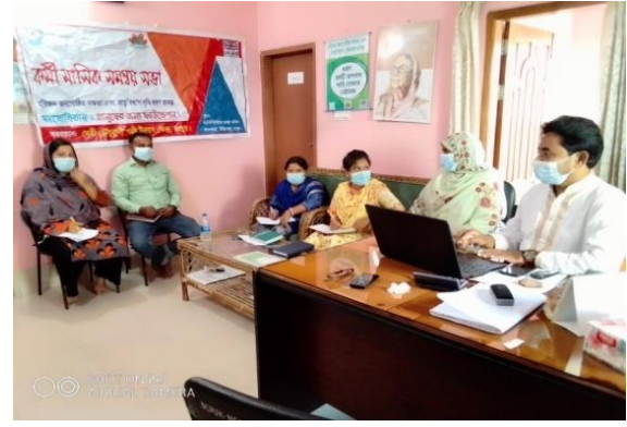
Staff co-ordination Meeting.