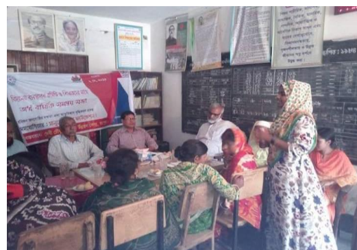
School Program with teacher and SMC committee.