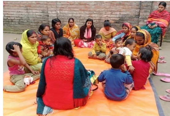
Beneficiaries are aware by ASC Monthly Meeting.