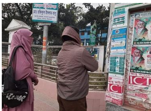
Poster Developed on COVID-19 for awareness Raising.